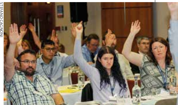
■ Delegates at the civil service sector conference in Nottingham also discussed how Prospect will tackle the challenges facing members – see pages 4-7

areas where it is being degraded. (See findings of Prospect's skills and career survey on page 7.)