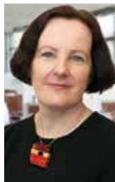
■ Scovell – We need data that captures the job families, professions, specialisms and skills in Prospect areas