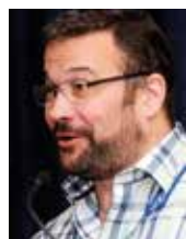
■ Nunn – educate and lead