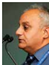
■ Pabla – access to redeployment pool