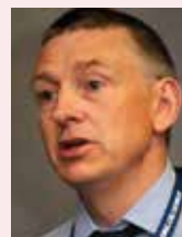
■ Kerins – a big bunfight