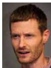
■ Nash – seek specialist input