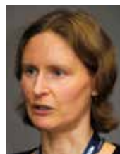
■ Turner – creeping disparity