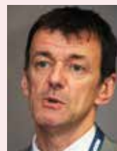
■ Kay – expose discrimination

included: "If I've got two members of staff marked 'must improve' I pick the one who will create the least fuss."