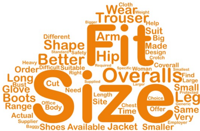
Word Cloud 2 - Improvements to PPE that women would like to see

Respondents were given the opportunity to suggest improvements to their PPE. 2293 overall provided comments, of which just 28 were positive. Word Cloud 2 summarises the main themes of the responses for those working in energy. :