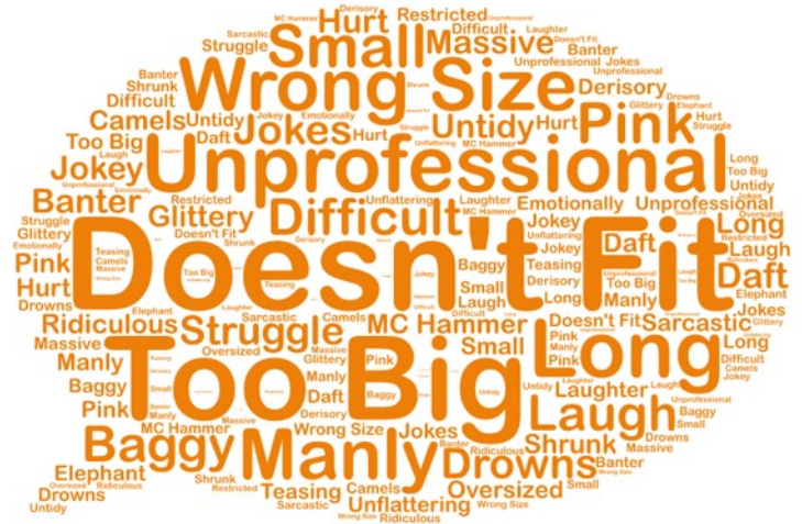
Word Cloud 1 - Comments women have received whilst wearing their PPE

42% of energy sector respondents have been on the receiving end of comments whilst wearing their PPE (compared to 28% overall) and, although a small minority reported positive feedback, the overwhelming majority were derogatory. Word Cloud 1 illustrates the kind of comments that women are subjected to for no other reason other than their PPE is ill-fitting.