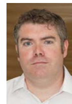
McEvoy – act now to beat changes

MEMBERS WITH defined contribution pensions take note – from 6 April the money purchase annual allowance will be reduced from £10,000 to £4,000.