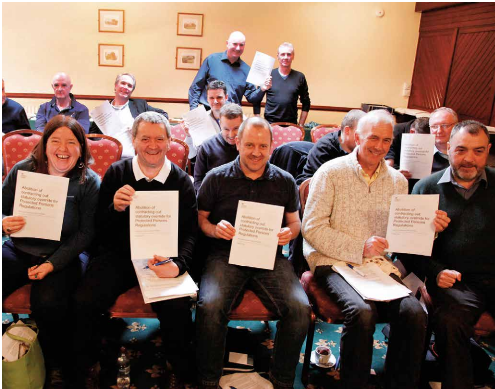
■ Members in ScottishPower celebrate the union's successful defence of the protected pension rights gained on privatisation at their annual delegate meeting in 2014. Prospect is seeking a meeting with the energy secretary amid fears those protections could be under fire again