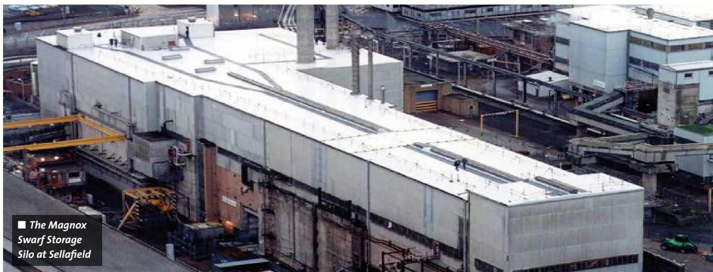
■ The Magnox Swarf Storage Silo at Sellafield