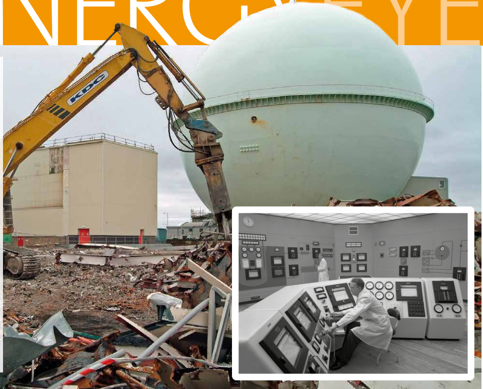
DSRL & NDA

Operators controlled the reactor systems from a room next to the sphere ( inset ).