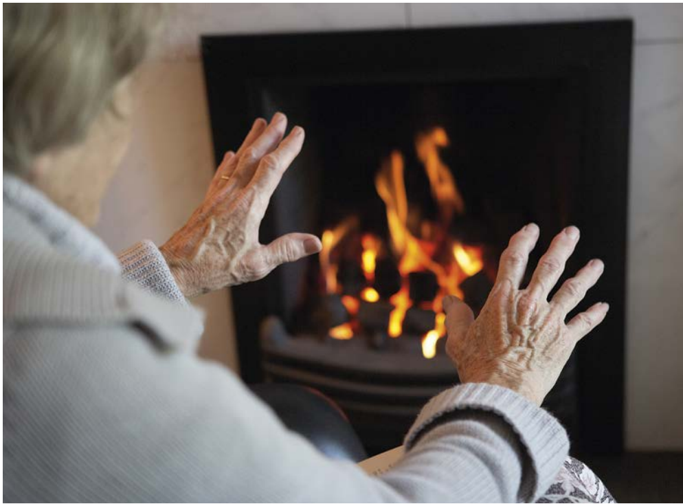
■ Poorest, most vulnerable and oldest likely to engage with the market