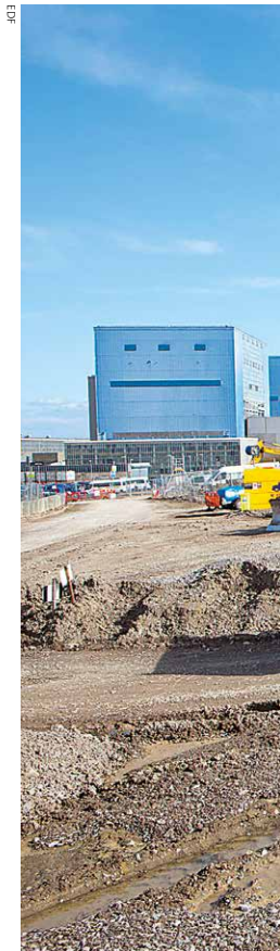
■ Work on the Hinkley Point C construction site with existing power stations in the background