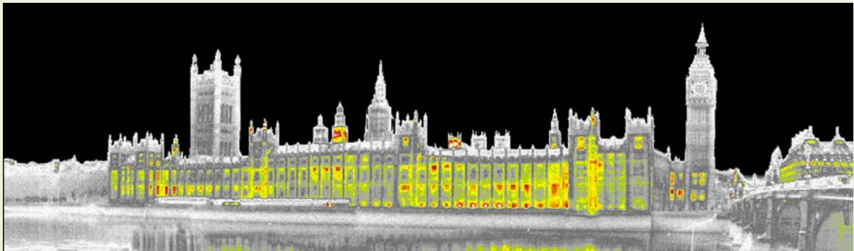
Thermal imaging of the houses of parliament

In an industrial or workplace setting thermal imaging minimises down time, repair time, labour costs and disturbance of occupant and can provide verification of a job well done.