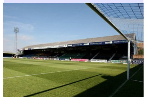
Roots Hall, the home of Southend United